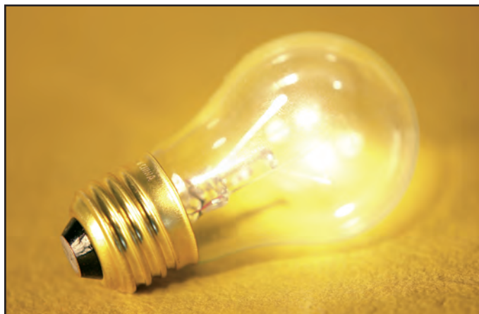
Lewis Latimer's contribution helped make the electric light bulb reliable and affordable.